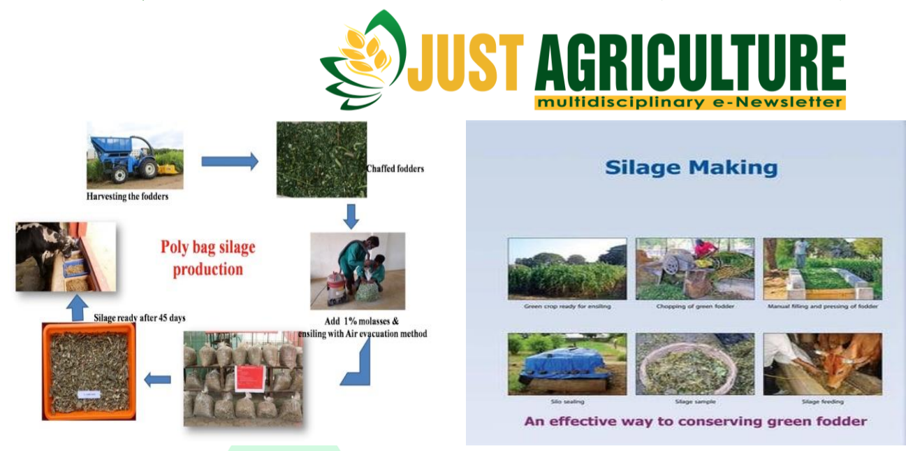
Fig. No. 1. Polybag Silage Production